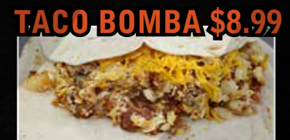
TACO BOMBA $8.99

Filled with up to 5 ingredients: Egg, Carne Asada, Papas, Bacon, Ham, Cheese, Groundbeef, Beans, Chorizo, Sausage, Barbacoa. Beef or Chicken fajita, extra $2.89 each