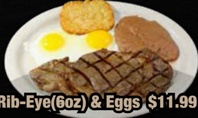
Rib-Eye(6oz) & Eggs $11.99