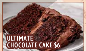
ULTIMATE CHOCOLATE CAKE $6