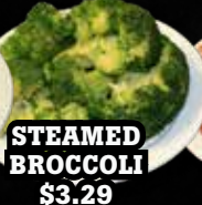
STEAMED BROCCOLI $3.29