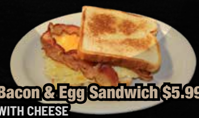
Bacon & Egg Sandwich $5.99 WITH CHEESE