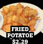
FRIED POTATOE $2.29