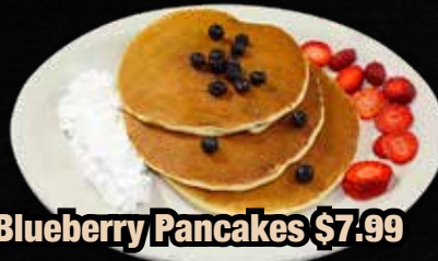
Blueberry Pancakes $7.99