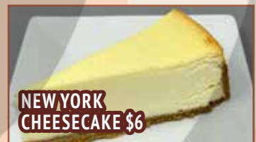
NEW YORK CHEESECAKE $6