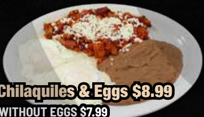
Chilaquiles & Eggs $8.99 WITHOUT EGGS $7.99