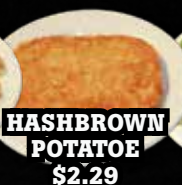
HASHBROWN POTATOE $2.29