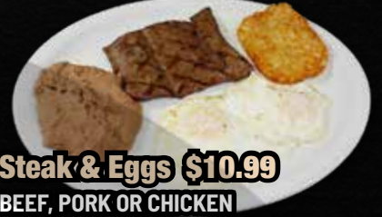
Steak & Eggs $10.99 BEEF, PORK OR CHICKEN