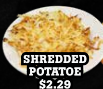
SHREDDED POTATOE $2.29