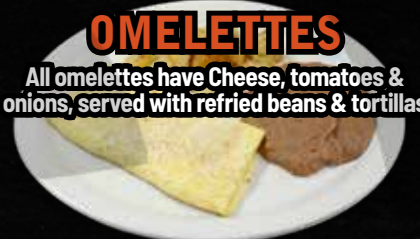
OMELETTES All omelettes have Cheese, tomatoes & onions, served with refried beans & tortillas