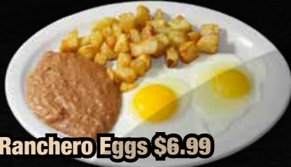
Ranchero Eggs $6.99