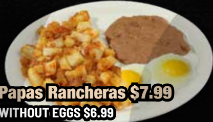
Papas Rancheras $7.99 WITHOUT EGGS $6.99