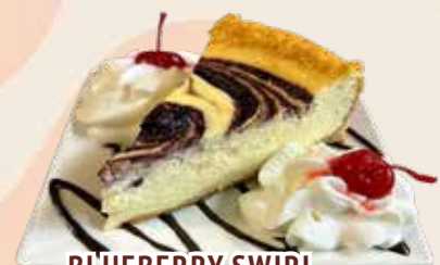
BLUEBERRY SWIRL CHEESECAKE $6