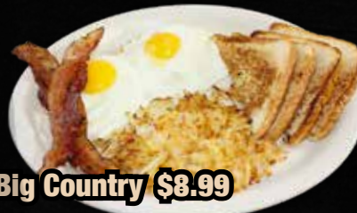
Big Country $8.99