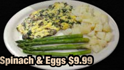
Spinach & Eggs $9.99