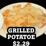
GRILLED POTATOE $2.29