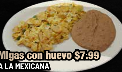
Migas con huevo $7.99 A LA MEXICANA