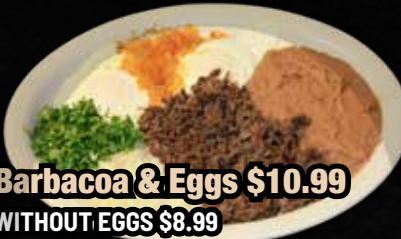
Barbacoa & Eggs $10.99 WITHOUT EGGS $8.99