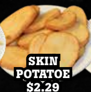
SKIN POTATOE $2.29