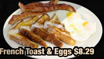
French Toast & Eggs $8.29