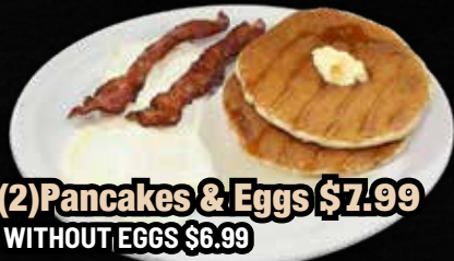
(2) Pancakes & Eggs $7.99 WITHOUT EGGS $6.99

AFTER 11:00 AM, TACOS ARE 69¢ EXTRA, PLATES $1.99 EXTRA, BURRITOS $1.29 EXTRA SUBSTITUTIONS EXTRA CHARGE