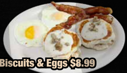
Biscuits & Eggs $8.99