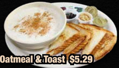
Oatmeal & Toast $5.29