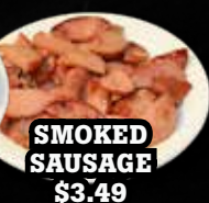
SMOKED SAUSAGE $3.49